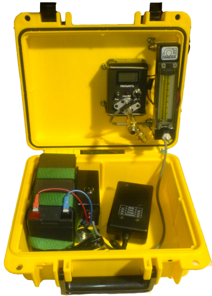
Helium detector with flowmeter and heavy-duty case